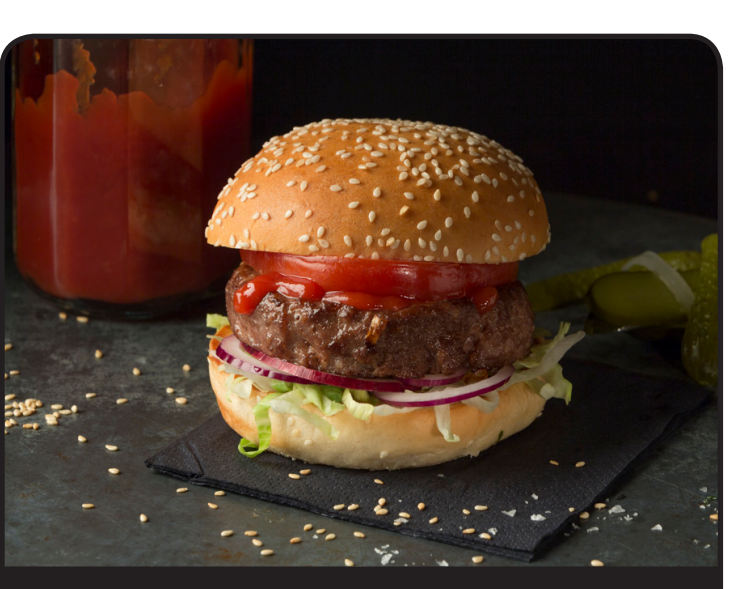
COGOI AMERICAN STYLE SESAME BUN