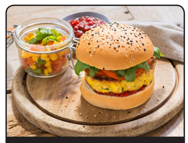
COGO3 VEGAN BURGER BUNS