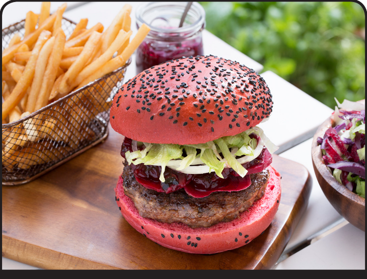
HF03 BEETROOT & BLACK SESAME BUN